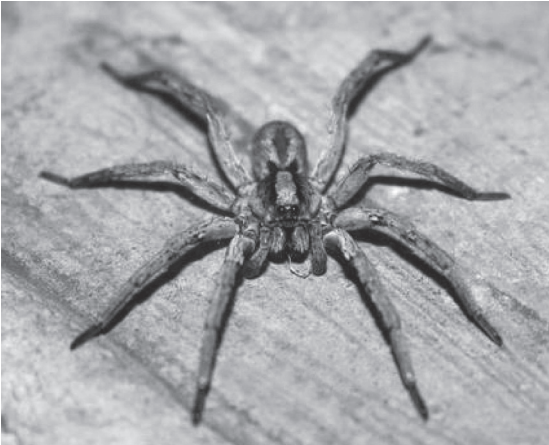
Magnification \times 1