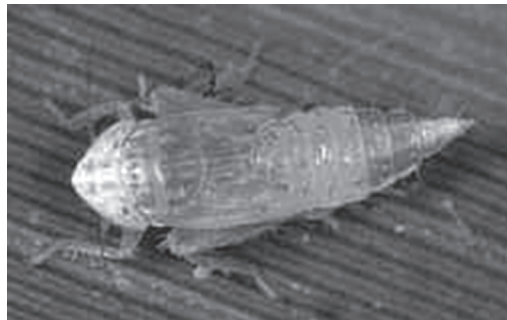
Magnification \times 10

Plan an investigation to determine the effectiveness of wolf spiders, bred in the laboratory, in the control of leafhopper nymphs in rice fields.