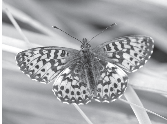
Small Pearl-bordered Fritillary Magnification \times 1.5

This butterfly lays its eggs on low-growing plants such as Viola riviniana (Dog Violet), on which the caterpillars feed when they hatch.