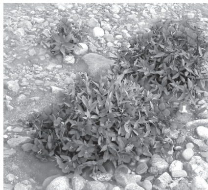
} Clump of Epilobium latifolium

The photograph below shows three clumps of Epilobium latifolium .