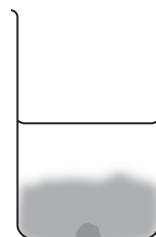
after two days