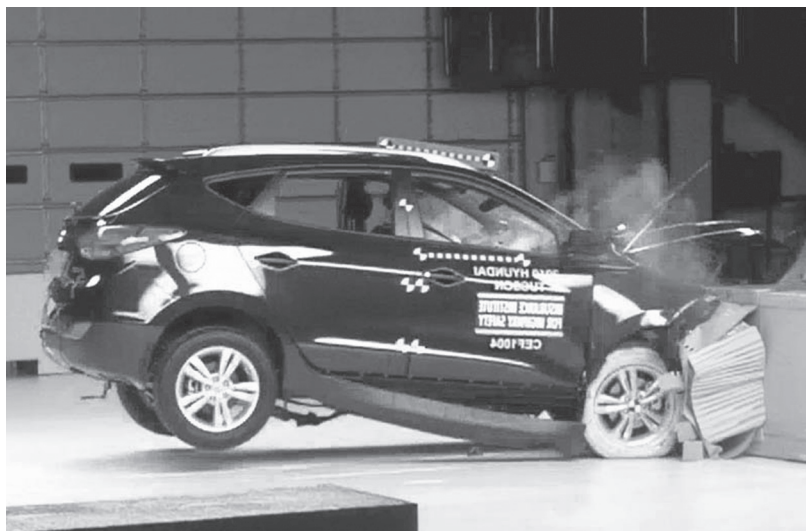
(Author: Brady Holt, 2010)

(c) In a crash test, a car runs into a wall and stops.