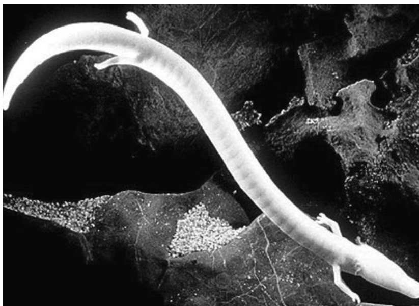
Magnification \times 0.1

Olms have a number of special adaptations: external gills as adults, undeveloped eyes, lack of skin pigmentation and a slow metabolic rate.