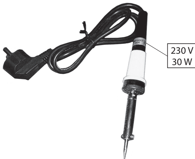
Soldering iron A

(a) Soldering iron A operates when connected to the mains supply.