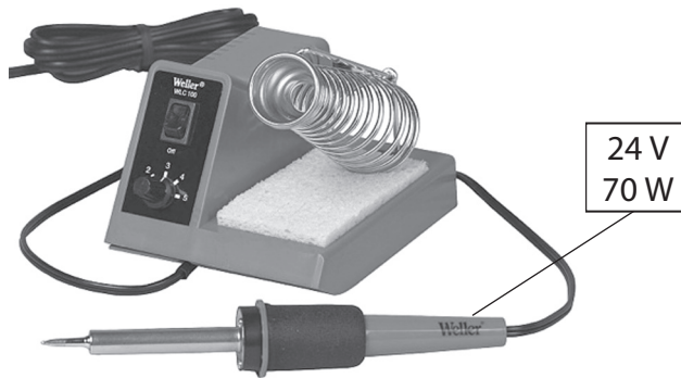
Soldering iron B

(b) Soldering iron B is connected to a low voltage power supply.