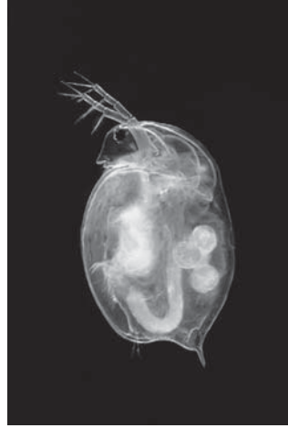
Magnification \times 20

Daphnia can be affected by pesticides in freshwater.