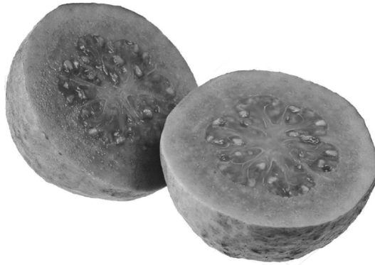
Magnification \times 0.5

This fruit is a good source of vitamin C. Two varieties of guava, Donaldson and Supreme, contain different concentrations of vitamin C.