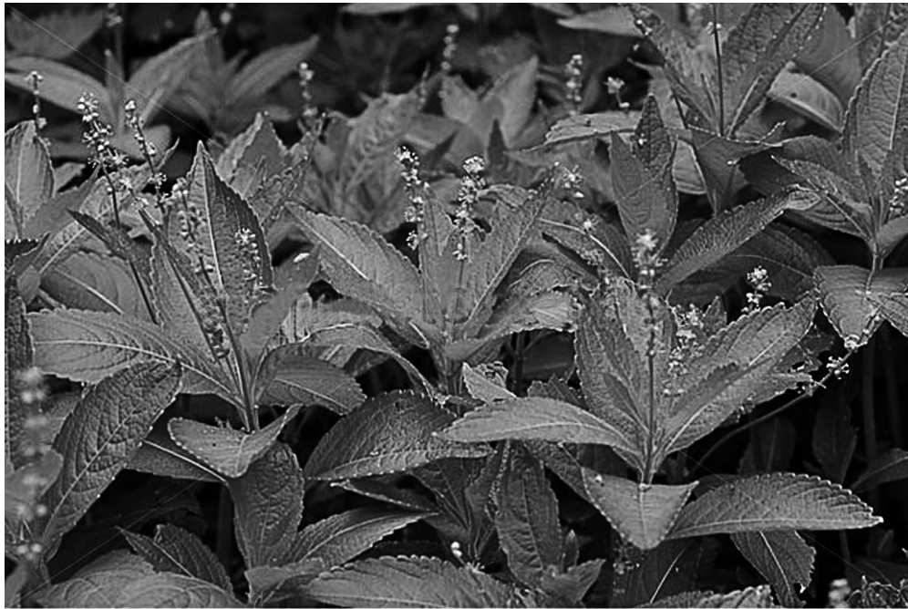
Magnification \times 1.0

3 The photograph below shows Mercurialis perennis , a plant found growing in woodland.