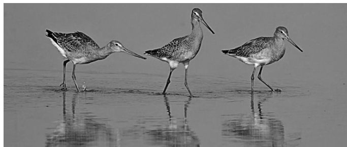
Magnification \times 0.05

2 The photograph below shows three black-tailed godwits.