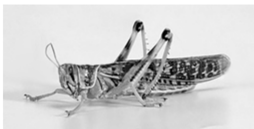
Magnification \times 1.0

1 The photograph below shows a locust, Locusta migratoria .