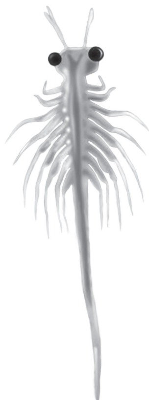
Magnification \times 10

3 The photograph below shows an adult brine shrimp.