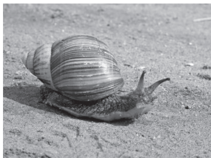
Giant African Land snail, Magnification x0.5

The student selected a snail (A) and placed it on a glass plate across which it was able to move. The student tapped the plate with a glass rod, next to the snail, causing the snail to stop moving and withdraw into its shell. The student recorded the time, in seconds, it took for the snail to re-emerge from its shell and start moving again.