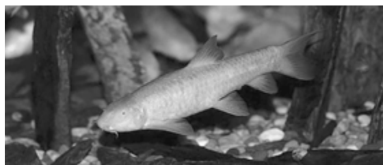
Magnification \times 1.5

2 The photograph below shows Garra barrimiae , a species of fish that feeds on aquatic plants.