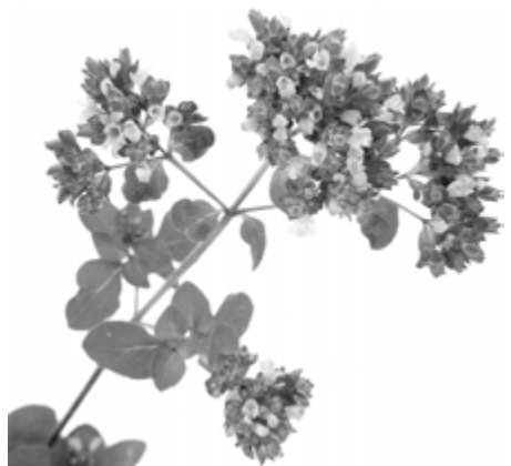
Magnification \times 1

3 The photograph below shows oregano, a plant used to flavour food. Some of the chemicals produced by this plant may have antimicrobial properties.